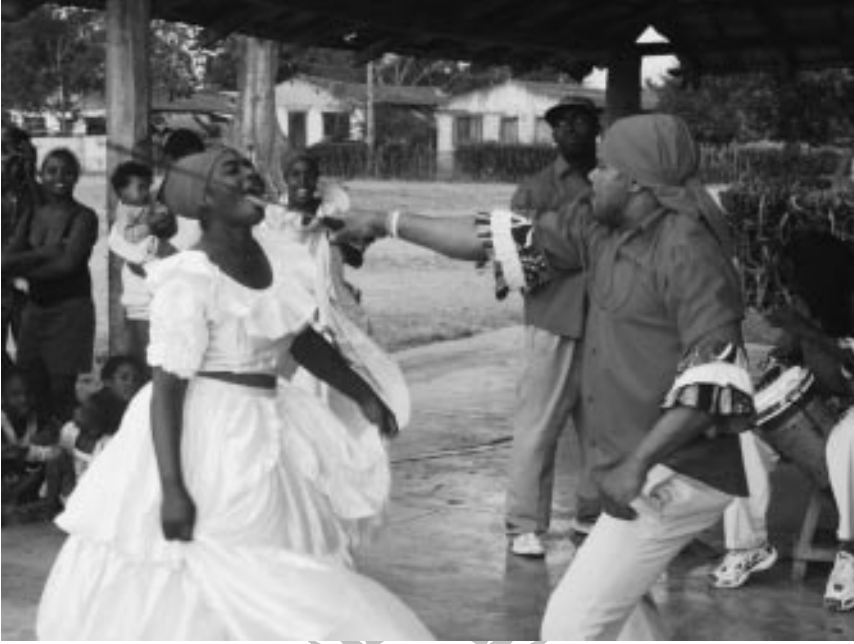
Figure 7.2. Gagá performance by Grupo Folklórico Thomson.

Could they “dance the same dances,” or were there clashes? At present, the tumba francesa societies identify their dances as “francés,” but other folkloric troupes describe the same repertoire as “franco-haitiano.”